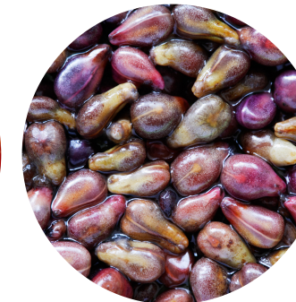
Grape seed grind