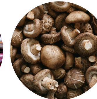
Shiitake medical mushroom